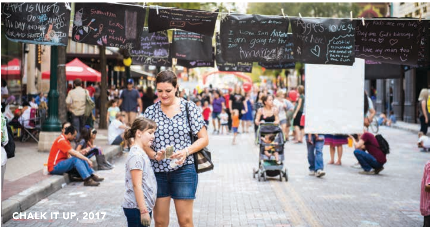
CHALK IT UP, 2017

In 2017, Chalk It Up was named “Best Downtown Event” at the 2017 Centropolitan Awards. This year’s Chalk It Up features an exciting new footprint which extends along the freshly redesigned Main Avenue. All support received for this free, family event will ensure the sustainability of Artpace’s public programs and the Artpace Teen Council. We hope you will join us as a sponsor during this once-a-year opportunity.